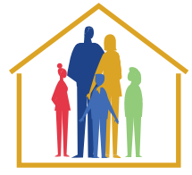
Welcoming a Child

We partner with churches to establish a sustainable ministry that serves vulnerable children.