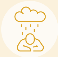
Are you struggling?

Please reach out and start a conversation. We are here to help.